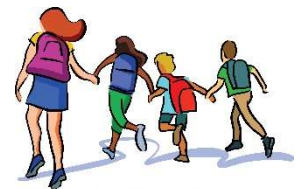
Pray for Our Students