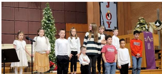
December 10 – Children’s Program then the Scrooge play at the UCCC.